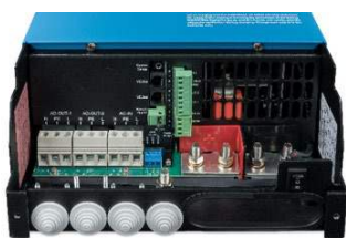
Connection area 12/3000/120-50