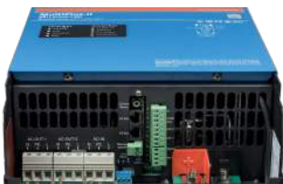
Connection Area MultiPlus-II 3k