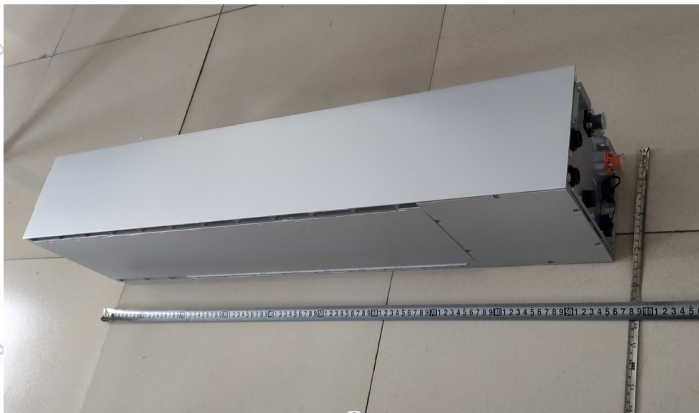
Figure 1 Overall view I of battery (电池外观图I)