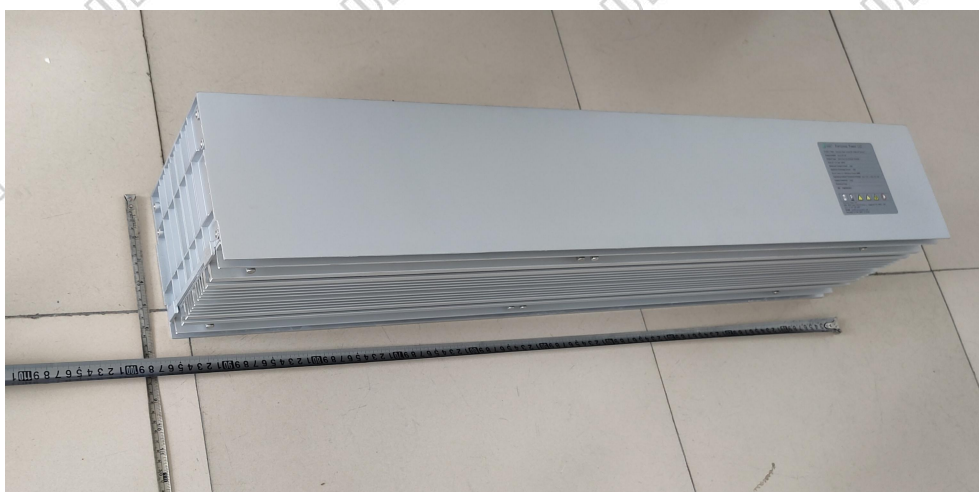
Figure 2 Overall view II of battery (电池外观图II)