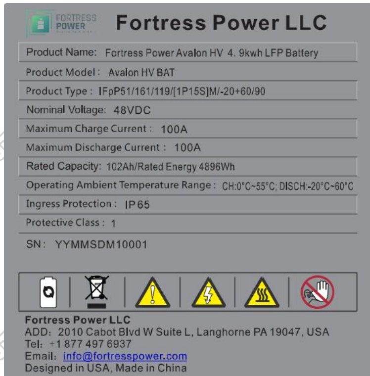
Figure 3 Battery Label (标签图)